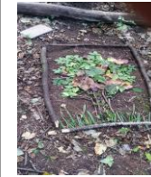
Stick Picture Frame