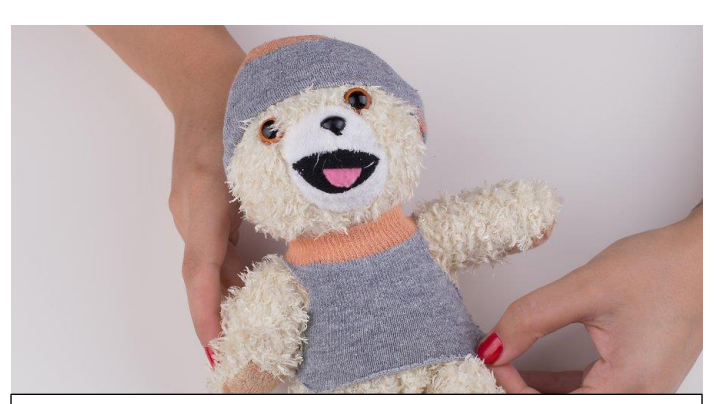
3. Pull the jumper created in (2) over the teddy body and put the other piece on teddy's head as a hat.